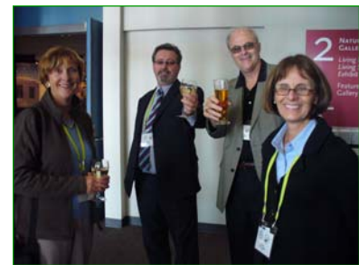
Cheers from the Welcome Reception at Royal BC Museum

vantage of Victoria's numerous tourist attractions. Thank you to everyone who participated!